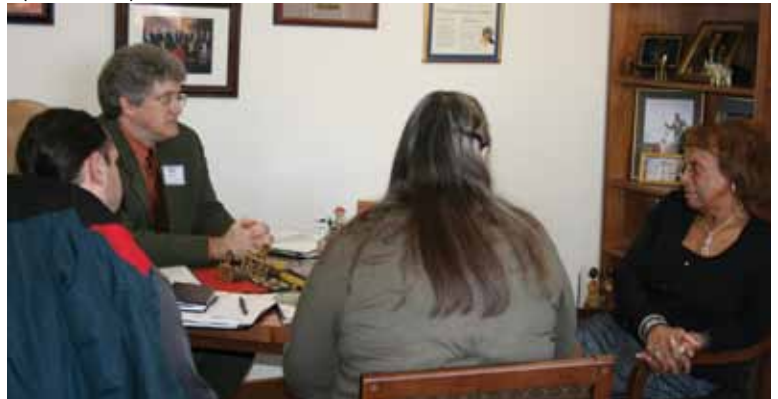
Local 2278 (WOUFT) members meet with Senator Jackie Winters during 2011 PLAN LED.