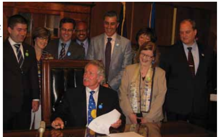
Governor Kitzhaber signed the PLAN supported “Cool Schools,” which allows energy efficiency upgrades to schools without the need for further funding from state budget.