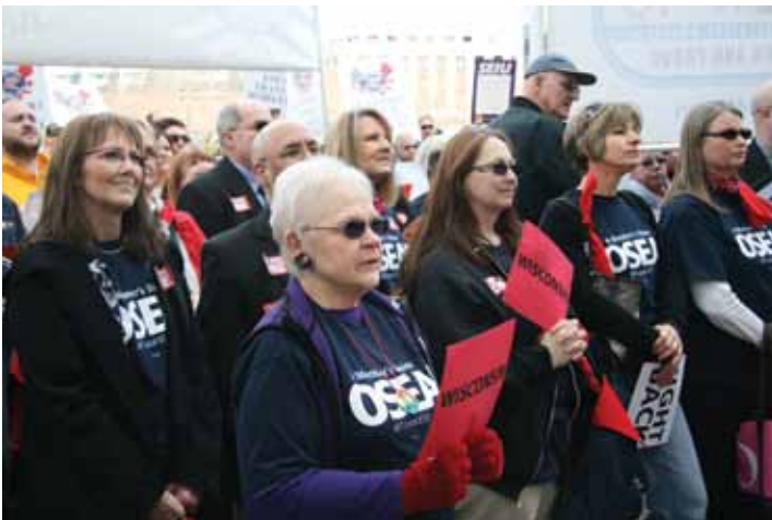
OSEA members rallied in support of living wage jobs at the Oregon AFL-CIO Jobs Rally in March.

To shine a light on use of tax credits and property tax abatements, this law will help Oregon taxpayers understand where more than $350-million in tax credits for economic development went in the last two years. Without the new law, information on who receives tax expenditures, and whether the intended results actually occurred was difficult to gauge. Now, information related to credits and abatements for economic development will be posted on the Oregon transparency website.