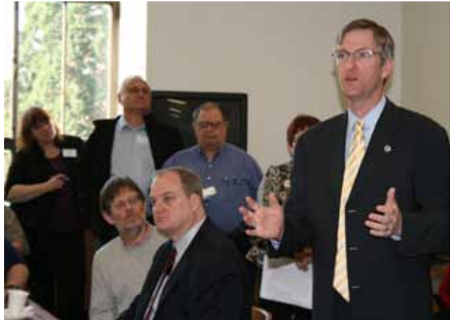
State Treasurer Ted Wheeler speaks to AFT in Oregon members on PLAN Legislative Education Day.

Though this law included increases in filing and mediation fees, funding for the Employment Relations Board (ERB) was only extended for the first year of the biennium. ERB provides services to assist with labor relations disputes for over 3,000 employers and 250,000 employees in the public and private sector, as well as through an assessment on state government and general fund. To solve the second year funding, the legislation directed a labor and management workgroup to find a solution in time to report to the 2012 legislative session. The workgroup began in August and includes representatives of AFT-Oregon and OSEA.